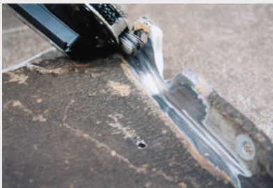
Especially suitable for applications involving welding seams, contours and edges. With sand blasting effect, ensures good adhesion for tin coating and trowel application.