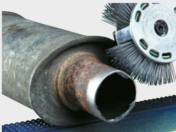
Derusting and cleaning work. Not for Al or die-cast aluminium!