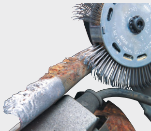
High-performance rust removal brush with deep-pore cleaning action, particularly around the edges and in hard-to-reach areas. With sand blasting effect!