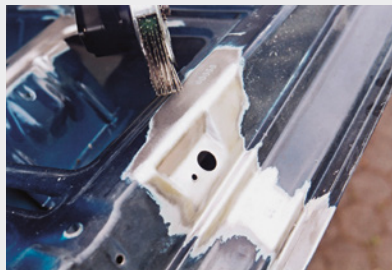
Paint removal in contoured and sharp-edged areas, 90° angle. No sand blast effect.