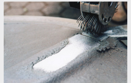
Removal of underbody seal and sealing compounds, and quick removal of paint.