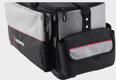
External pocket for cordless charger