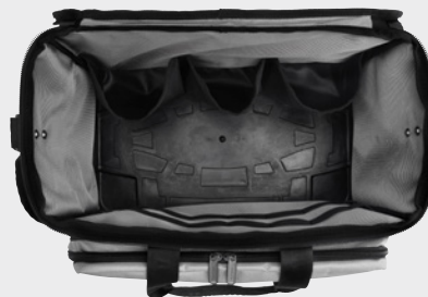
Inside pockets for batteries