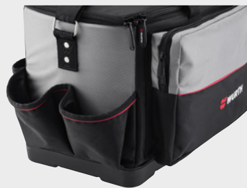
External pockets for batteries External pocket with zip