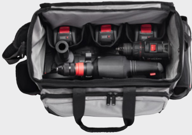
Power tools and batteries not included in scope of delivery