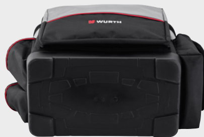
Stable, water-resistant plastic bottom