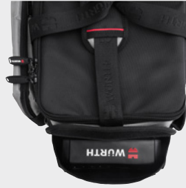
Battery charger not included in the scope of delivery