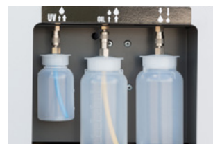
Equipped with 1 fresh oil reservoir, 1 used oil reservoir and 1 UV additive reservoir