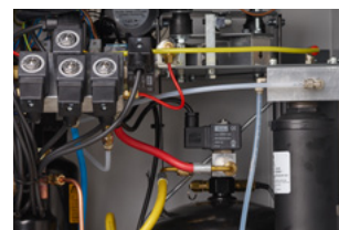
New filter and 2 fans for exceptionally long A/C service application time