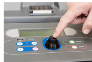
CooliusSelect: Simple data input thanks to new navigation dial